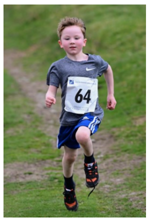
Broughton Hill Race